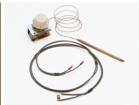
▲ GWRB-T Remote Bulb Thermostat