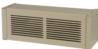
▲ GWTB-2 Blower

The optional blower mounts above the heater and cycles on automatically to enhance air circulation.