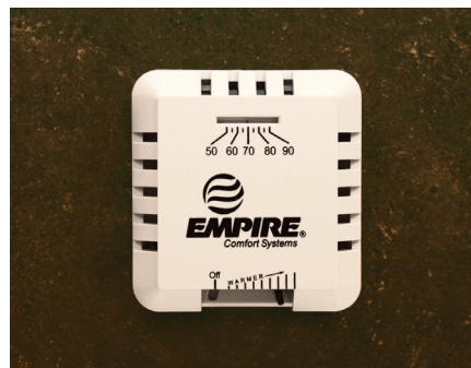
▲ TMV Wall Thermostat